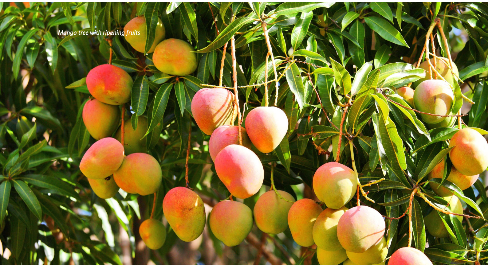
Mango tree with ripening fruits