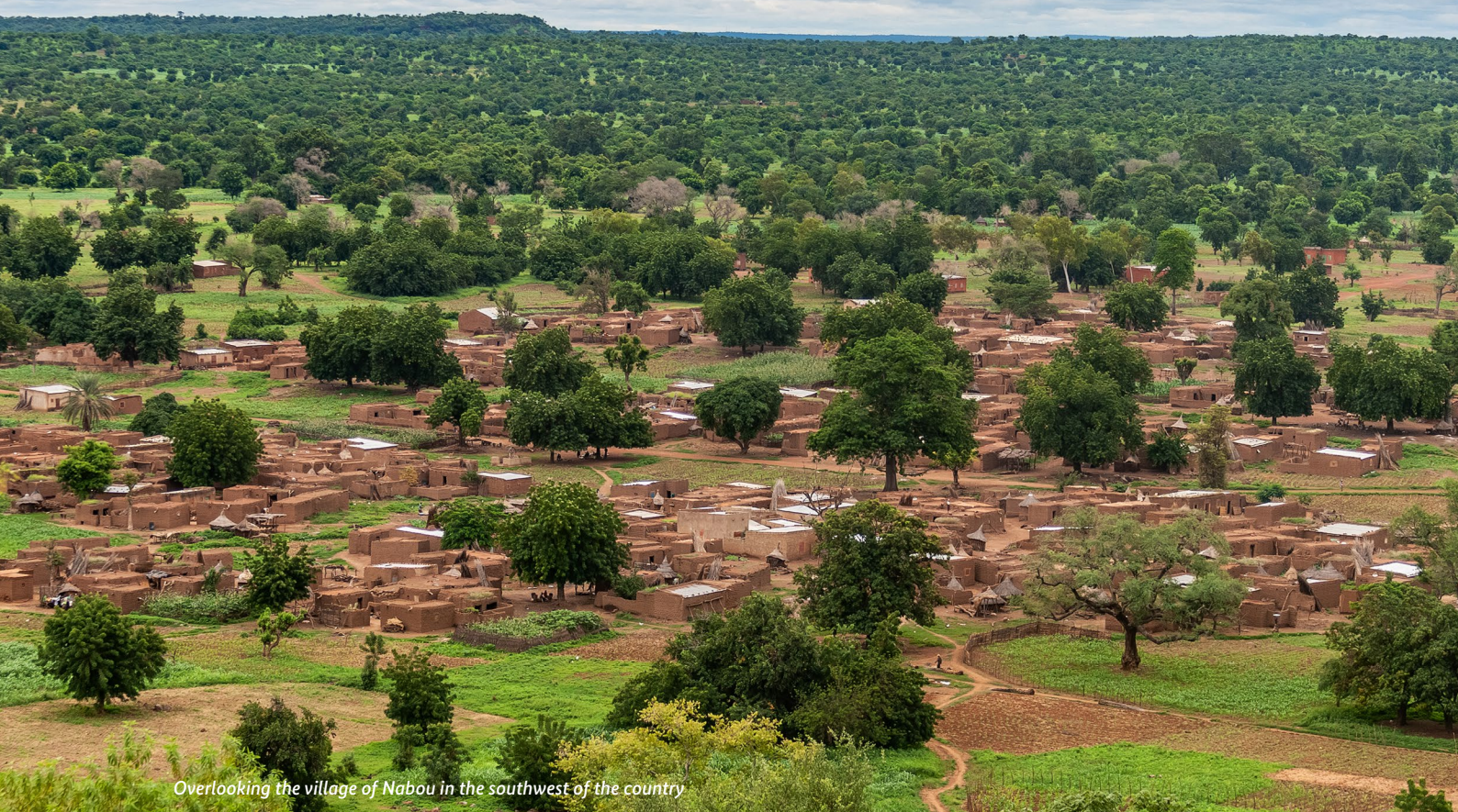
Overlooking the village of Nabou in the southwest of the country