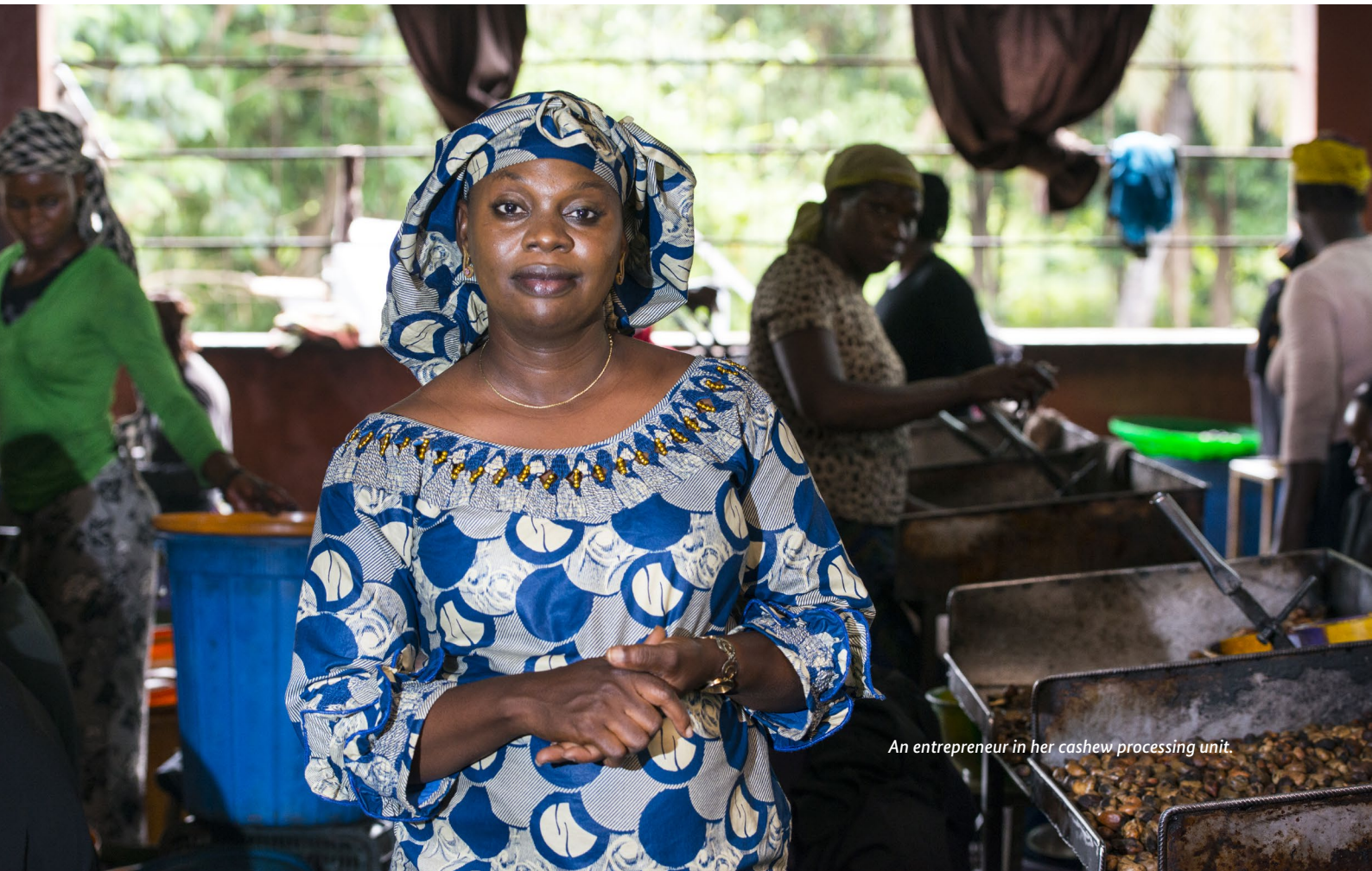
An entrepreneur in her cashew processing unit.

Approximately 30 sites, mostly in the Ouagadougou area, sell organic (PGS) products. The network is expanding. Various local organic trade fairs took place in 2018 and 2019. The international market is based on trade with importers (mainly from Europe) looking for raw products and usually taking the lead in organising the exports.