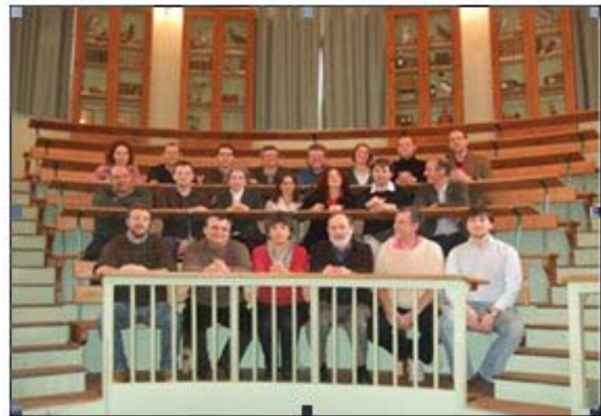
On the picture: the ORWINE project meeting in Montpellier, April 2008

One of the main working fields of the ORWINE project at the moment is the completion of so-called fact sheets that contain 19 oenological substances that are being assessed