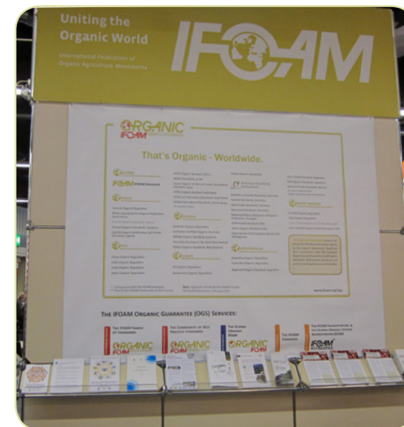
The IFOAM booth at BioFach 2011 attracted countless visitors.