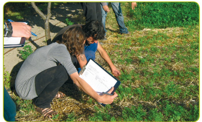
Members of PGS initiatives testing the Ecovalle farm visit protocol

Ecovalle is an association created in 2007 in Lecrin Valley, Granada, for the promotion and development of organic agriculture and livestock production. Decision making is by consensus, through the association's assembly, and it is open to individuals, cooperatives and other associations. Ecovalle organized a working group to develop a PGS. The focus of the activity is to promote consumer awareness, by encouraging a more direct and proactive approach to food, that goes beyond the act of buying it, and creating a space where organic producers can sell their products locally, without intermediaries. An example is the farmers markets for local producers in some of the larger towns of the region, such as Padul and Dúrcal.