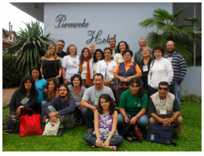
Participants of the Latin American PGS Seminar, Antonio Prado, Brazil, November 2009.

processes, whether rural or urban, based on social justice principles, which concurs with positions already expressed by the French PGS stakeholders and likeminded organizations.